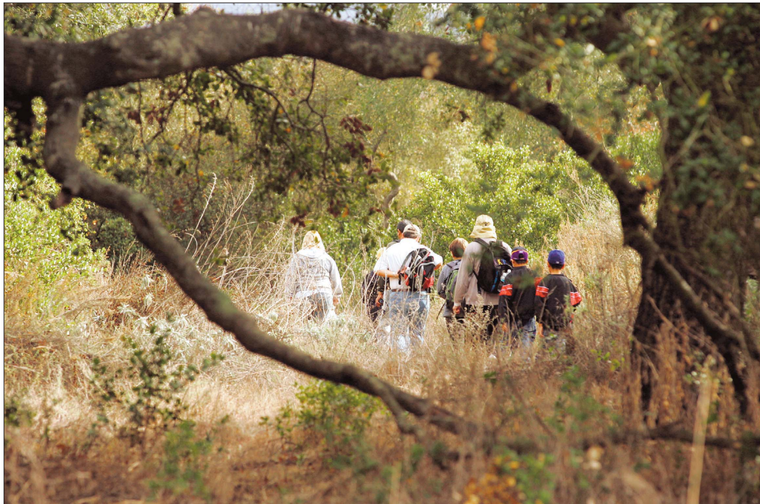
MADE IN THE SHADE: A family of hikers at the Donna O'Neill Land Conservancy winds its way through the giant oak trees while taking in the scenery. Visitors get a chance to walk the private land and learn Native American skills on the Native Skills Family Hike.